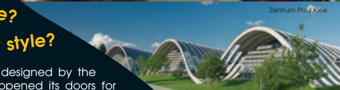
Zentrum Paul Klee