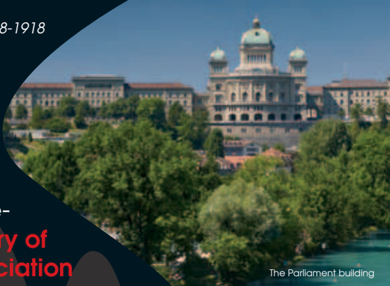
The Parliament building

Organising committee EBTA Conference 2013 www.ebta2013.ch