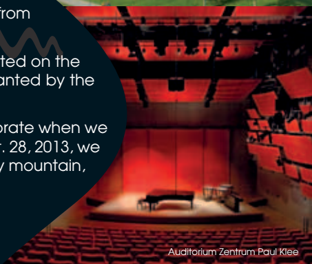
Auditorium Zentrum Paul Klee