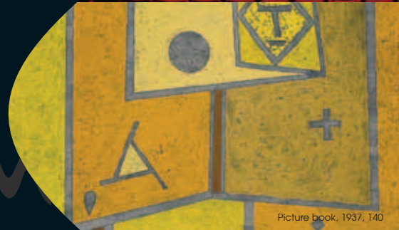
Picture book, 1937, 140